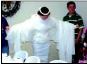
Hickory Grove won the Angel Decorating Game