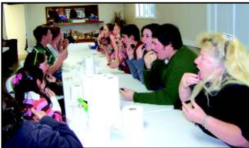
Neely Youth won the cookie game.

Non-Profit Org U.S. Postage Paid Permit #10 Collins, Mississippi