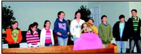
Hickory Grove Youth